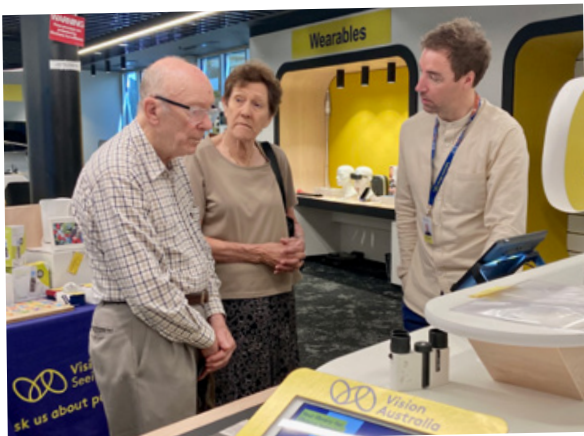
Visiting the Vision Store in Kooyong.